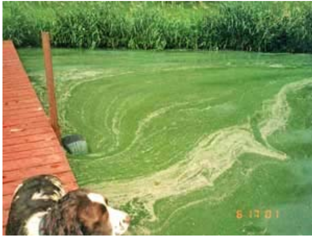
Figure 4. Dog near blue-green algae infested water.